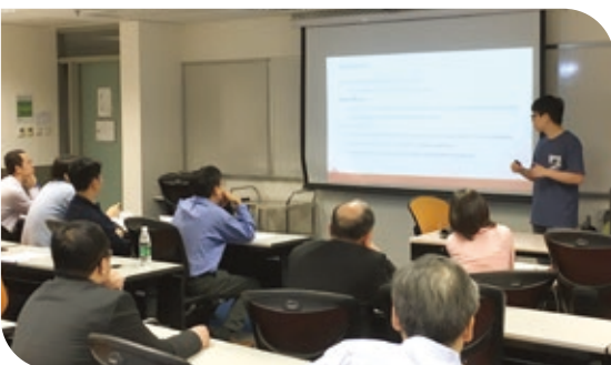
Department of Logistics & Maritime Studies: Research Postgraduate Student Symposium