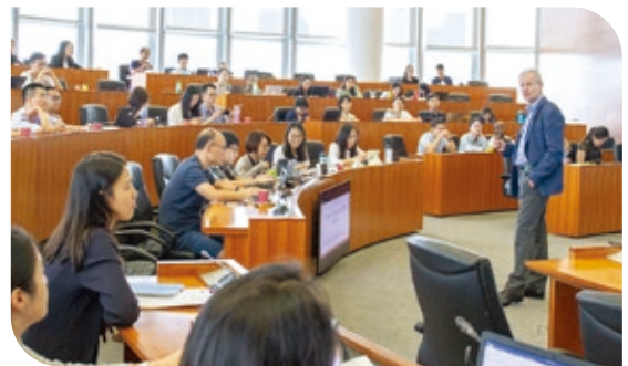
School of Accounting & Finance: The Doctoral Consortium of 2019 MIT Asia Conference in Accounting