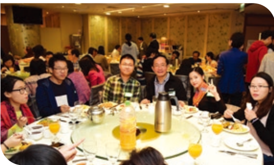
Faculty of Business: Gathering with FB Academic Staff