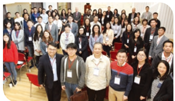
Department of Management & Marketing: 8 th Symposium of the Centre for Leadership & Innovation “The Future of Work Driving Change in Organizations”